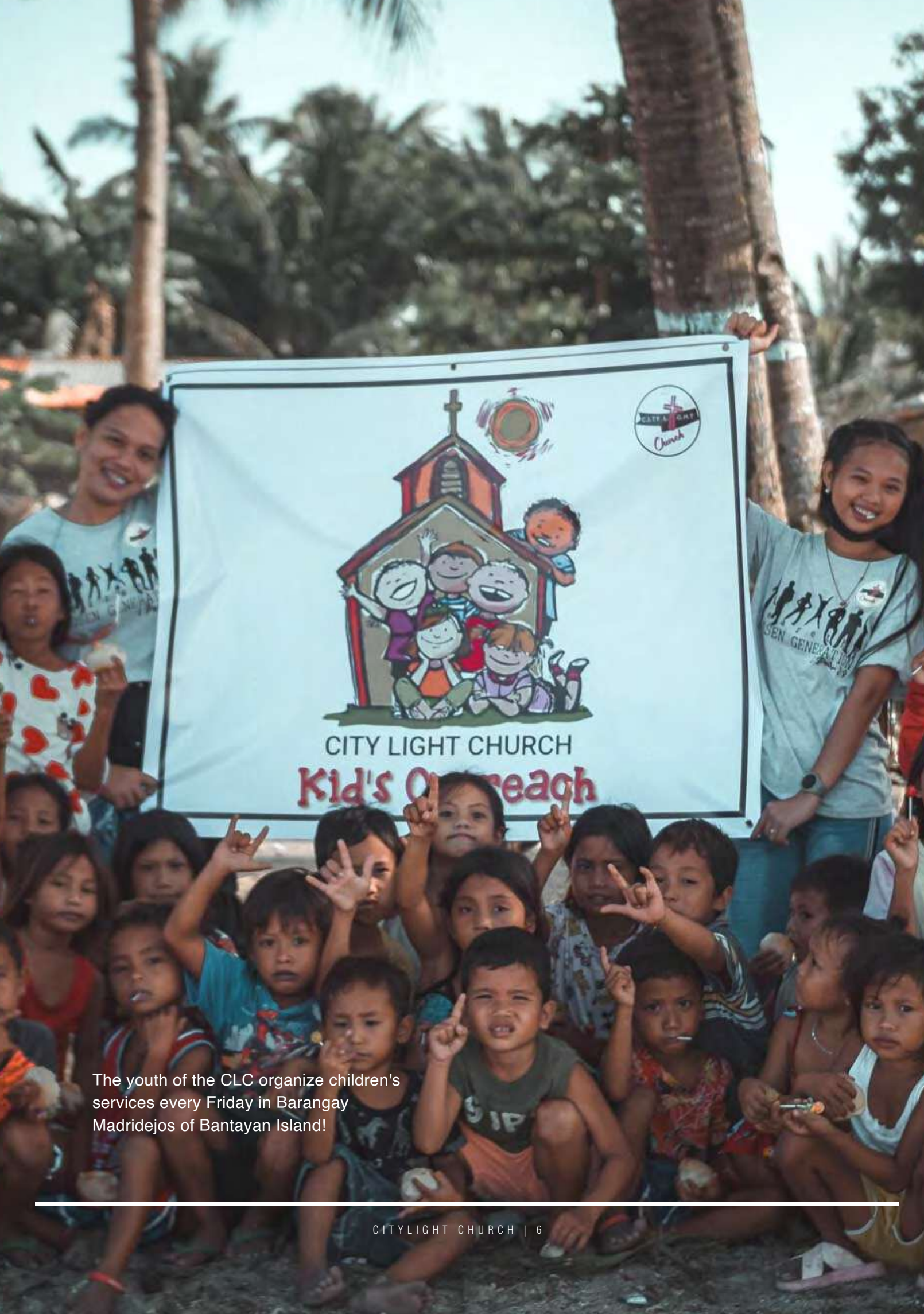
The youth of the CLC organize children's services every Friday in Barangay Madridejos of Bantayan Island!