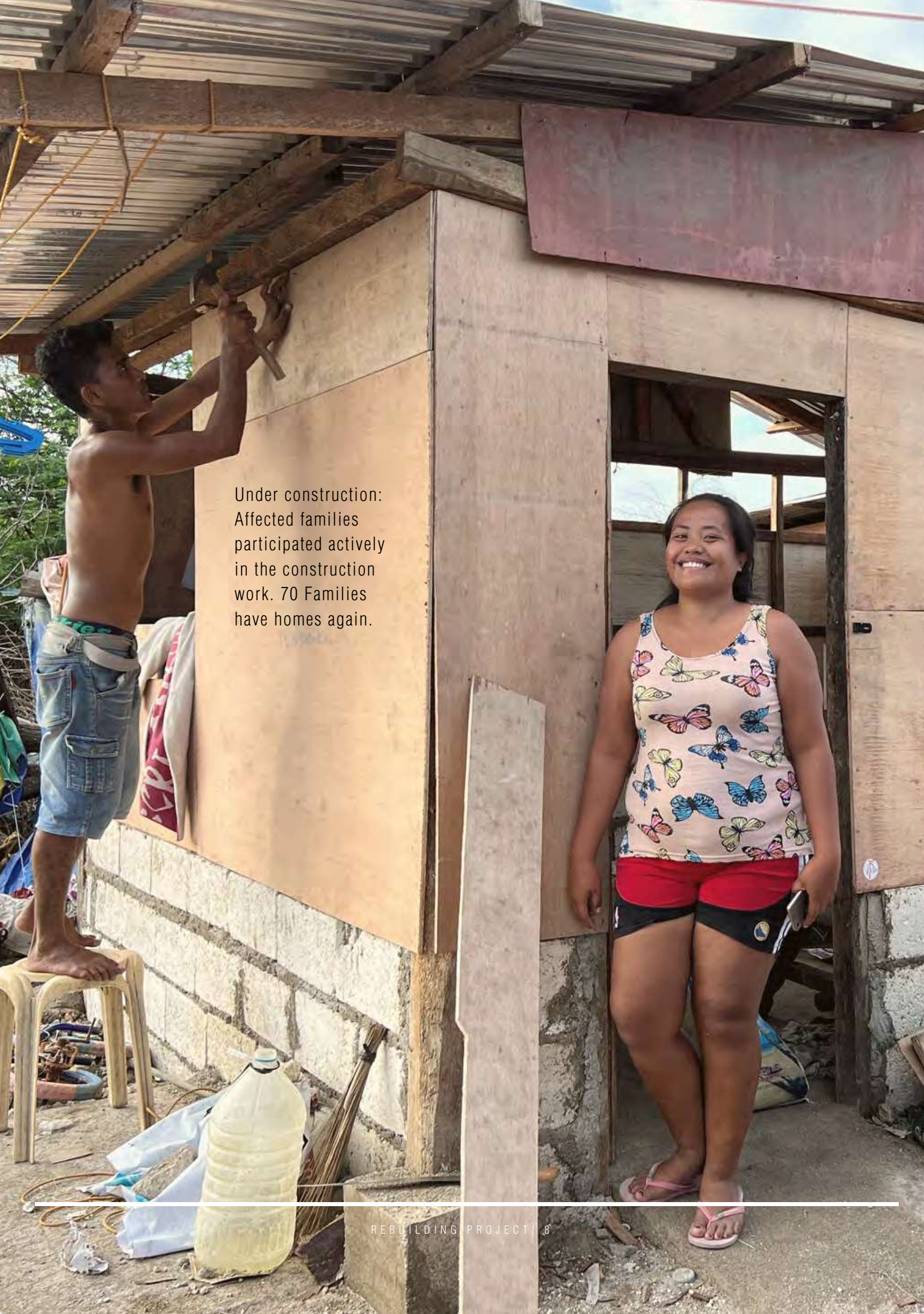
Under construction: Affected families participated actively in the construction work. 70 Families have homes again.