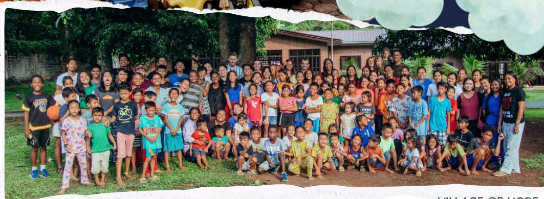
VILLAGE OF HOPE